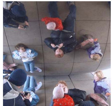
Chicago peanut frolicers