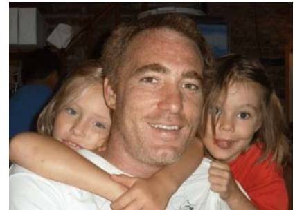
Geb and Family